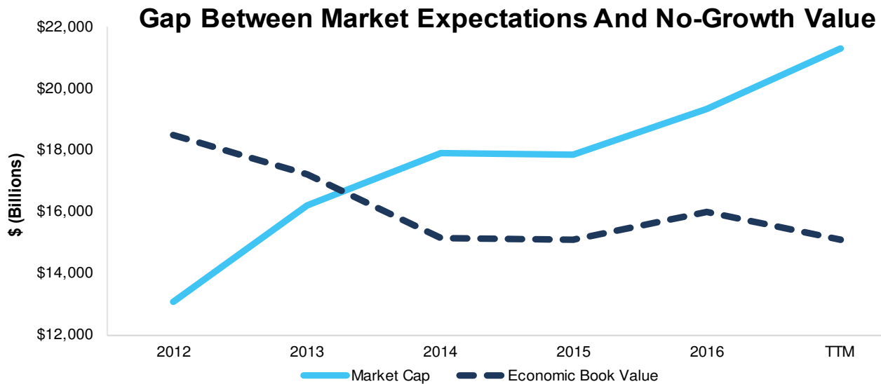
Figure 2: Market Cap Rising, Economic Book Value Falling