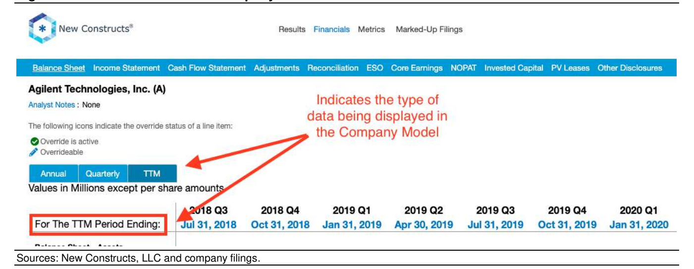
Figure 2: View TTM Data in Our Company Models

Per Figure 2, the type of data displayed is indicated by a dark blue color in the selection boxes, as well as the text to the left of the date periods. "Fiscal Year Ending" indicates Annual data, "Fiscal Quarter Ending" indicates Quarterly data, and "TTM Period Ending" indicates TTM data.