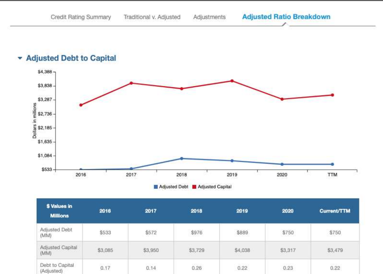
Adjusted Debt to Capital is Neutral

B's Adjusted Debt to Capital ratio is 0.22 based on Adjusted Debt of $750 million and Adjusted Capital of $3,479 million over the trailing twelve months.