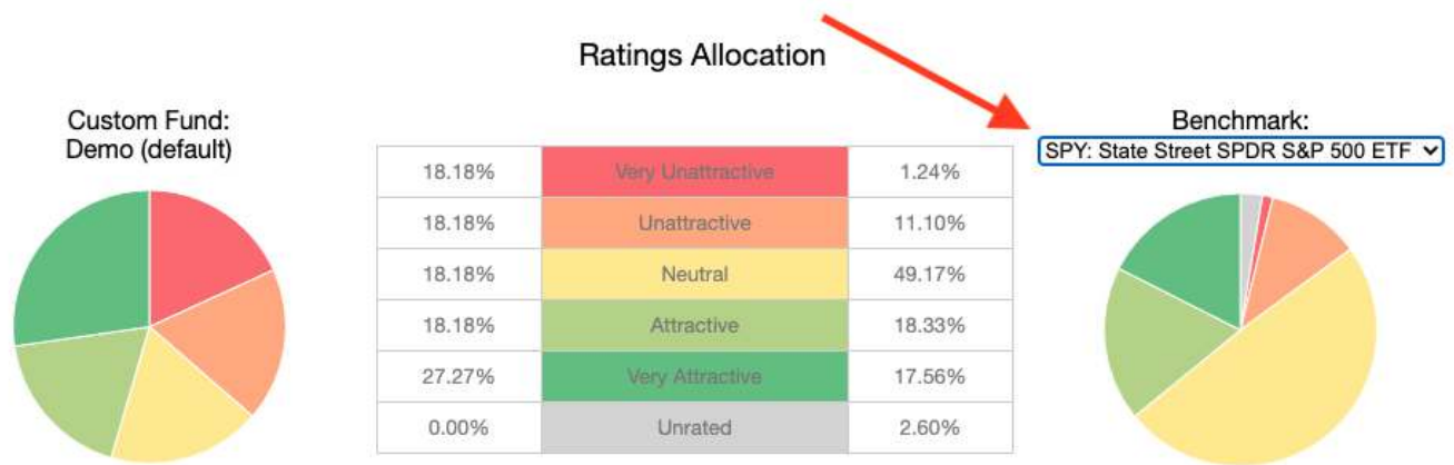
Figure 3: Compare Stock Allocation to Benchmarks