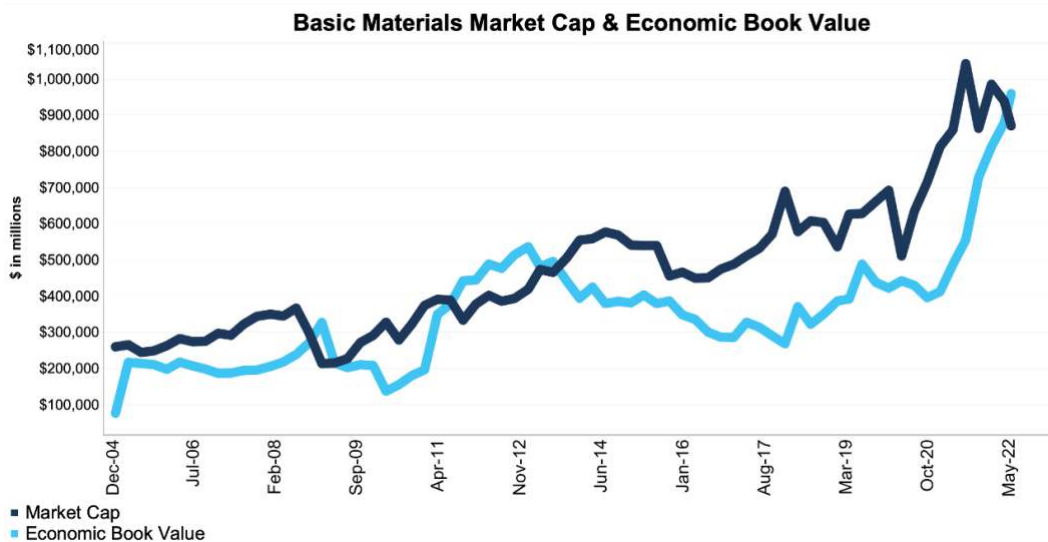
Figure 2: Basic Materials Market Cap & Economic Book Value: December 2004 – 5/16/22