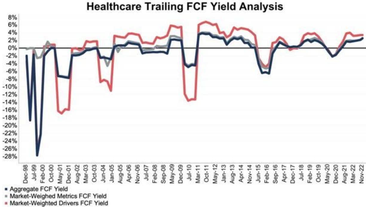
Figure 3: Healthcare Trailing FCF Yield Methodologies Compared: Dec 1998 – 11/25/22

Sources: New Constructs, LLC and company filings. The November 25, 2022 measurement period uses price data as of that date and incorporates the financial data from 3Q22 10-Qs, as this is the earliest date for which all of the 3Q22 10-Qs for the NC 2000 constituents were available.