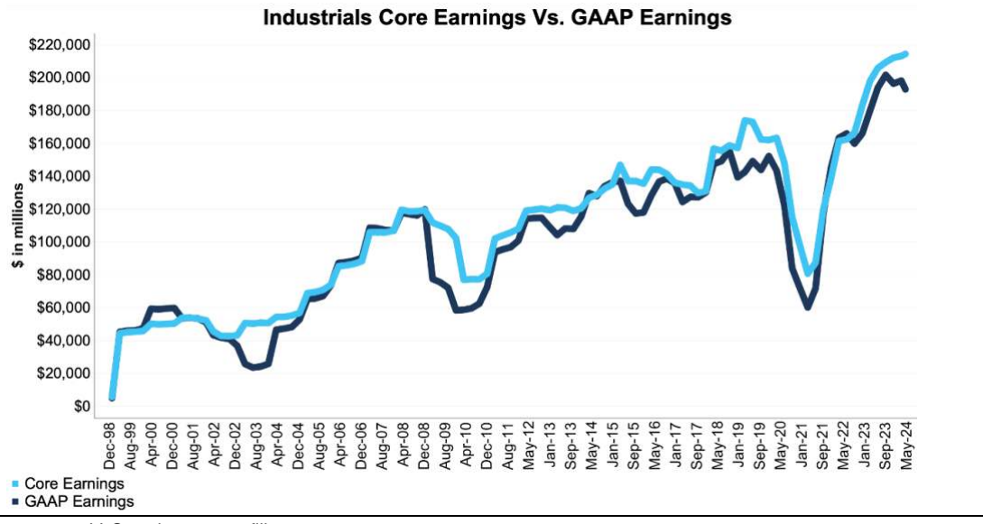
Figure 2: Industrials Core Earnings Vs. GAAP: 1998 – 1Q24