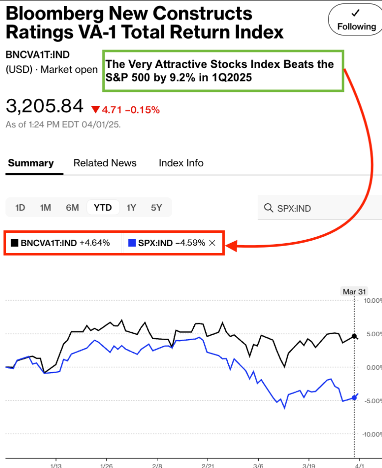
Figure 3: Very Attractive-Rated Stocks Strongly Outperform the S&P 500 in 1Q25

Figure 3 compares the performance of the Very Attractive Stocks Index, managed by Bloomberg, to the S&P 500. In 1Q25, the Bloomberg New Constructs Ratings VA-1 Index (ticker: BNCVA1T:IND ) was up 4.6% while the S&P 500 was down 4.6%.